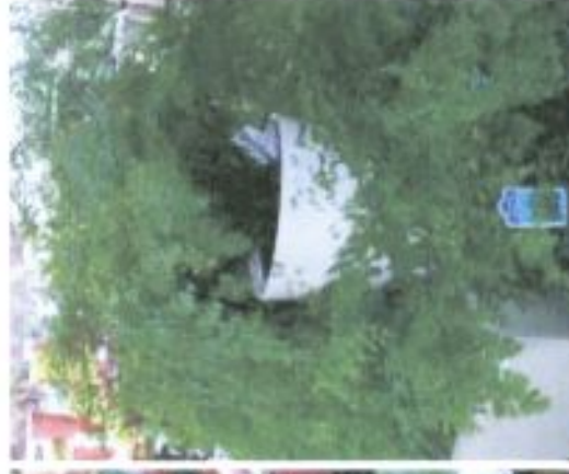
'Real World' research has shown that as few as 3 pot plants are required to significantly improve indoor air quality, not a jungle.