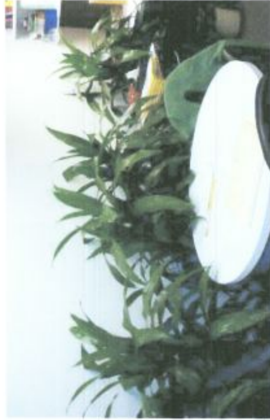
Research has shown that only 3 floor standing pot plants are required to significantly improve air quality in an average sized office or room.

Six table sized pot plants can easily fit in most rooms using tables and/or shelves. Air quality measurements were made during nine and five-week periods.