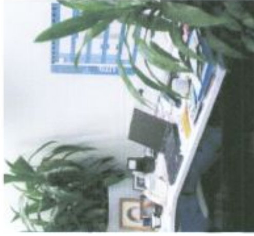
Six table sized pot plants (200 mm pots) are as effective as 3 floor standing pot plants (300 mm pots) in improving indoor air quality.

The offices were designed for single occupancy being 10-12 m 2 with a ceiling height of between 3-4m, which is comparable with