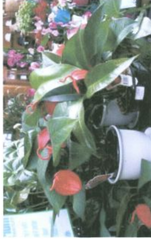
Just a few pot plants can significantly improve indoor air quality in both air-conditioned and non air-conditioned offices or rooms.

Portable monitors were used to sample every office on a weekly basis and provide readings of Total Volatile Organic Compounds (TVOCs), carbon dioxide, carbon monoxide, relative humidity and temperature. Individual VOCs were identified using passive Organic Vapour Monitors placed on shelves for one week, and analysed by WorkCover, NSW.